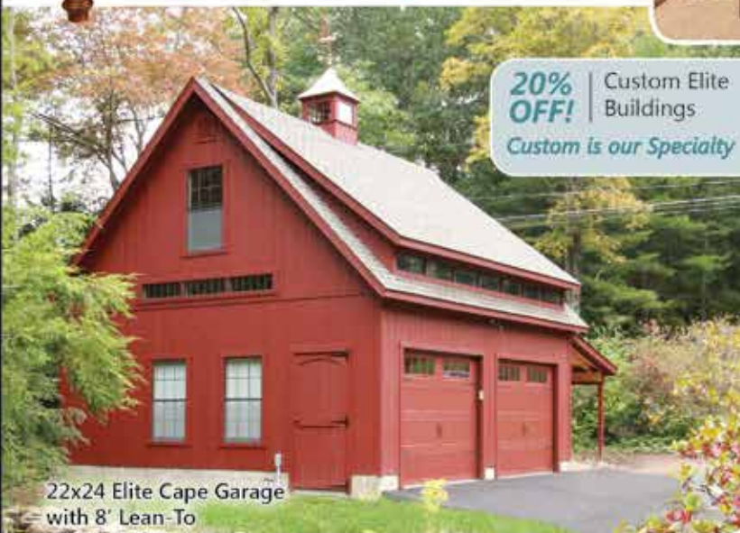
22x24 Elite Cape Garage with 8' Lean-To

Over 25 Dining Sets On Display! Verona Collection Shown