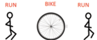
Proud to "DU" It

Ages 5-6 Run .3 miles Bike 1 mile Run .3 miles Ages 7-8 Run .7 miles Bike 1 mile Run .7 miles Ages 9-10 Run .7 miles Bike 2 miles Run .7 miles Ages 11-14 Run 1 mile Bike 2 miles Run 1 mile Ages 15-17 Run 1 miles Bike 4 miles Run 1 mile